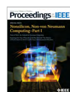
Proceedings of the IEEE