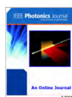
IEEE Photonics Journal